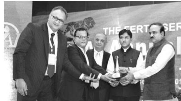
'Best Operating Plant' award by FAI

Coromandel Vizag unit has received the 'Best Energy Efficient Unit' award from Confederation of Indian Industry (CII) for the 3 rd consecutive year and the 'Best Operating Plant' award for efficient operations of Phosphoric Acid Plant from Fertiliser Association of India (FAI) for the 15 th time.