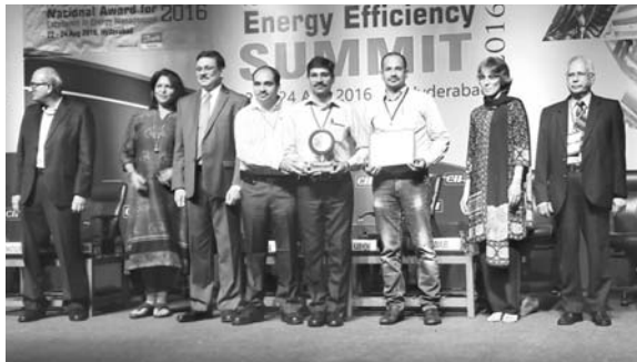
'Best Energy Efficient Unit' Award by CII