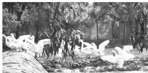
Birds Sanctuary at Kakinada Plant

During the last year, the Company invested in several projects and initiatives towards a sustainable growth viz., launched dedicated crop protection environmental lab, optimum utilisation of resources, responsible management of waste and effluents, reducing the energy consumption and air emissions and preservation of biodiversity.